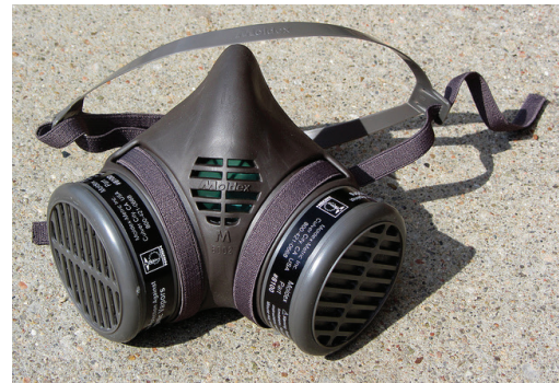
Figure 4. This half-mask respirator with replaceable black cartridges offers protection against organic vapors (pesticides).

*Base choice on text on cartridge label; colors may vary with printer or computer monitor.