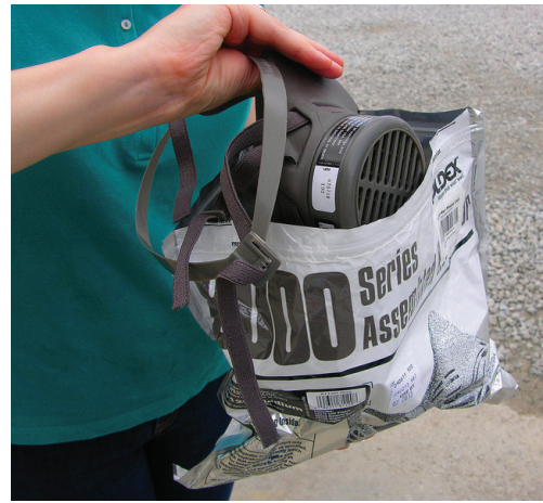
Figure 13. Store the respirator in packaging that can be sealed tightly.

Store the respirator in a way that preserves its shape and integrity, and protects it from contamination and extreme temperatures. Store filters, cartridges, or canisters and the respirator in the original respirator packaging ( Figure 13 ) or a resealable zipper storage bag, away from pesticides. The best type of storage container has an airtight seal, as filters, cartridges, or canisters can absorb pesticides and other organic vapors when exposed to air. Mark the storage container with the purchase date of the filters, cartridges, or canisters and a running tally of the total number of hours used or keep a separate log, discussed later.