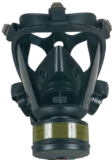
Figure 5. Canister filter respirator with an olive cartridge, effective against organic vapors, ammonia, and acid gases.

canister respirators are available (Figure 5). The canister is screwed into the mask or worn on the user's belt, back, or chest. A hose or tube connects the canister to the facepiece. Canister filter respirators are not to be used in areas considered immediately dangerous to life or health, such as a manure pit or silo with gases.