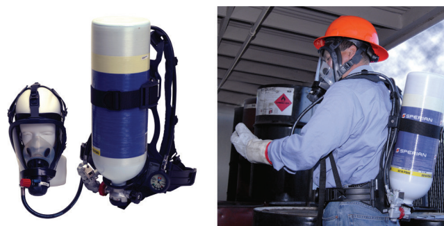
Figure 7. Self-contained breathing apparatus with facemask.

The air-purifying respirators just discussed are more commonly used when handling pesticides. The other category of respirator, atmosphere-supplying, supplies clean air directly to the user from a tank or compressor. An atmosphere-supplying respirator has positive pressure, because air is delivered to the breather. The tank may be stationary with an air hose to the respirator (supplied-air respirator), or portable and worn on the user's back, called a self-contained breathing apparatus or SCBA (Figure 7). SCBA respirators are appropriate for areas considered immediately dangerous to life or health. They are used when there is very little oxygen, such as in fire-fighting or in high concentrations of a very toxic pesticide in an enclosed area, such as during a fumigation.