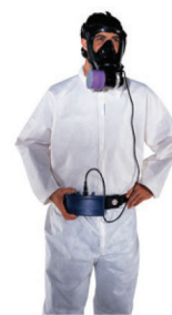
Figure 6. These PAPRs with a hood (left) and full-face mask (right) have a battery pack worn at the waist.