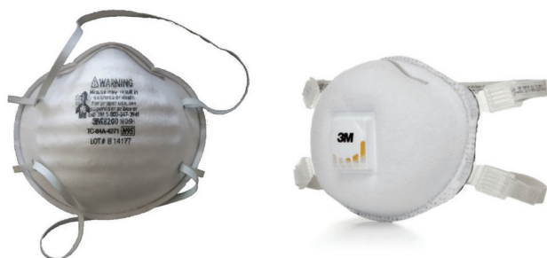
Figure 1. Two models of NIOSH-approved (TC-84A) particulate filter mask respirators. Both have a metal band at the nose area for adjustment. The mask on the left has straps that are not adjustable; its shape and construction may make it difficult to form the tight seal needed for protection. The mask on the right has adjustable straps and an exhalation valve.

This type of respirator is approved for protection against dust and mists. Older pesticide labels may refer to the particulate filter mask ( Figure 1 ) as a NIOSH TC-84A respirator.