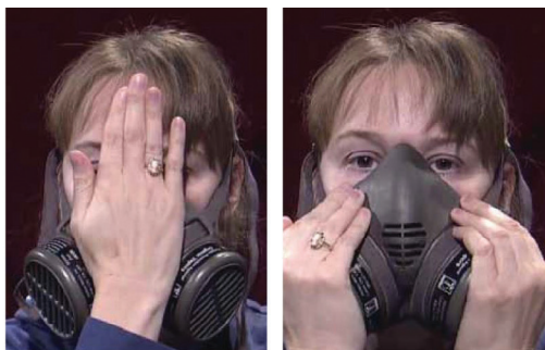
Figure 10. Positive (left) and negative (right) seal check.

Cover the inlet opening of each of the cartridges with your hands and inhale gently so the facepiece collapses. Hold your breath for about 10 seconds; if the facepiece stays collapsed, the seal is effective. If you can do this without feeling a rush of air around the faceplate, the seal is good. If the facepiece expands or air leaks under the facepiece, reposition and repeat the check until the seal is effective.