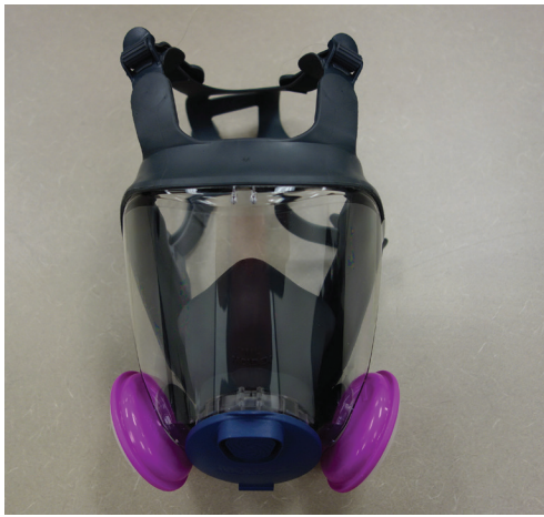
Figure 3. This full-face mask respirator with pink filters provides protection against dusts, as well as eye protection.